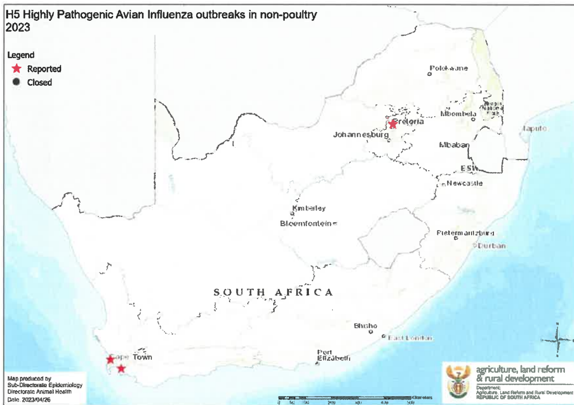
FIGURE 2: SPATIAL DISTRIBUTION OF HPAI H5 OUTBREAKS IN NON-POULTRY

The spatial distribution of the reported HPAI H5 outbreaks in non-poultry is represented in Figure 2 below.