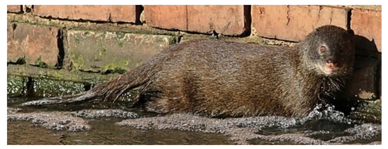
Figure 3: Water mongoose/ kommetjiegatmuishond/ Atilax paludinosus

Two ostrich farms in the Heidelberg area tested avian influenza positive, but the virus subtype could not be identified. It was only possible to exclude H5 and H7 subtypes and therefore high pathogenicity avian influenza.